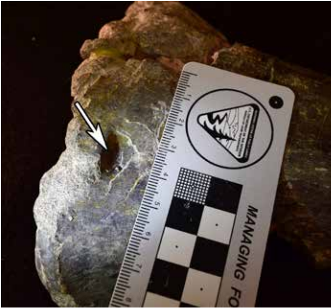
Example of marks the researchers were looking for