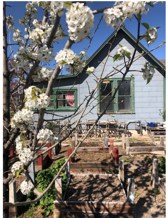
The victory garden waiting to be planted at Cross Orchards in front of the 1940s house.