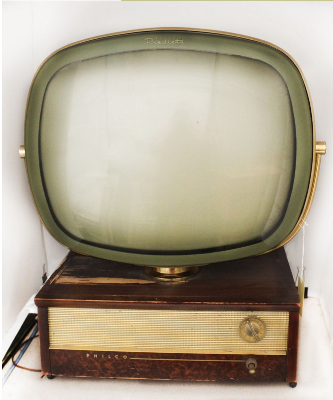
The Philco Predicta "Holiday" Television Circa 1958

This modern "space age" television was first introduced to the public in 1958. It was the first television that was not inside a wooden box and is reminiscent of today's screen only televisions with built in components. The Penthouse version of this model had a detachable screen and was the first television with a remote control. This black and white set was produced from 1958 till 1960. Its popularity waned with the introduction of the color television. However, the Philco Predicta will be remembered for its innovative sleek modern design the forerunner of television that incorporated by style and advanced technology.