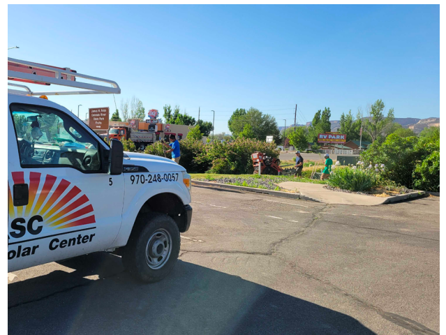
Installation of the EV Charging Station. The Station will be fully operational in the very near future.